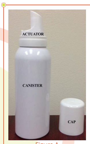
Figure A Parts of Ecoza topical foam canister